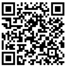
Salt Lake County Property Watch

Though not featured in the news coverage, many homeowners already benefit from title insurance policies purchased when they bought their property. An Owner's policy contains coverage for unmarketable title and many policies purchased since 2008 already contain insurance for post policy forgery and fraud and post policy clouds on title. Coverage varies, and deductibles may apply depending on the policy type, but many policy holders may already have insurance up to 150% of the original purchase price.