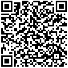
QR for KSL-TV Story