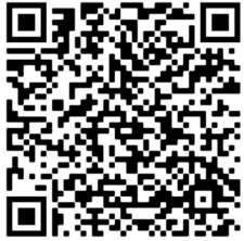
QR for KSL-TV Story